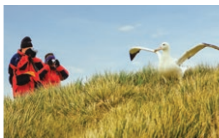
Fraser's dolphins; Colorful traditional wooden fishing boats, Cape Verde; Albatross, Falkland Islands.

For reservations, call your travel advisor or an Expeditions Specialist at 1.800.EXPEDITIONS (1.800.397.3348) • EXPEDITIONS.COM